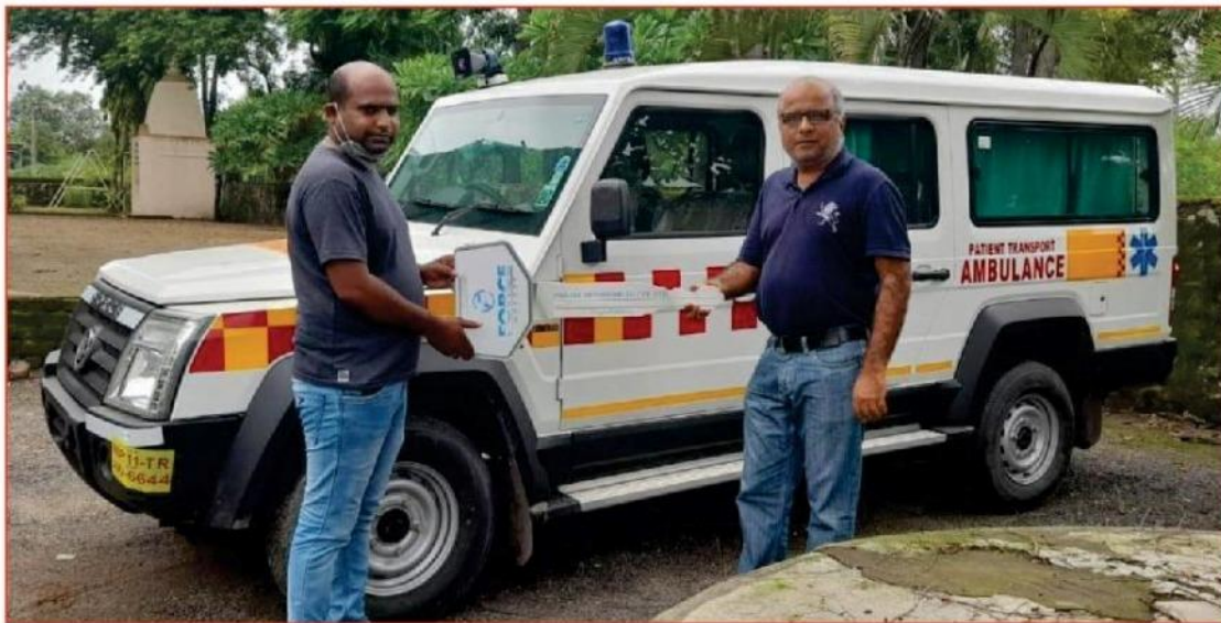
“Rotary Club of Chikhli River Front Permanent Project”