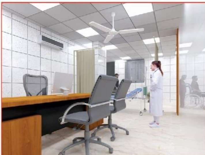
O. P. D.