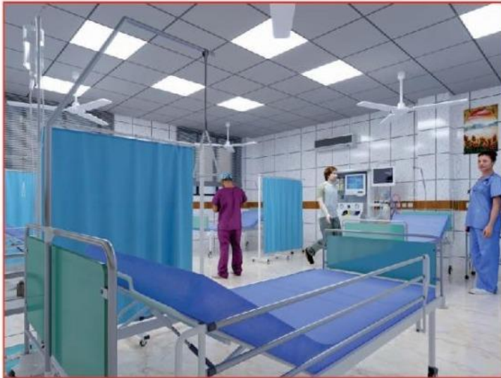
Emergency Casualty Room